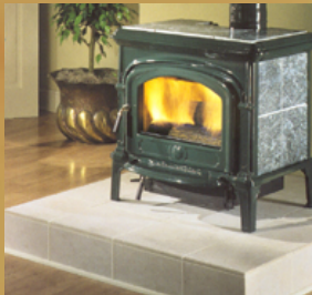
Close Fireplace Dampers