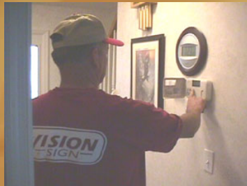
Turn off heating & air conditioning