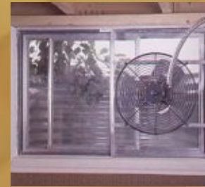
Turn off Window Fans