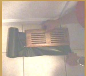
Seal Register Vents